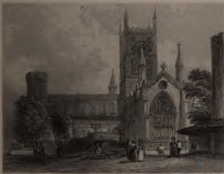
St. Dunstons Church, Southwark.

LONDON. GEORGE ROUTLEDGE AND SONS, BROADWAY, LUDGATE HILL.